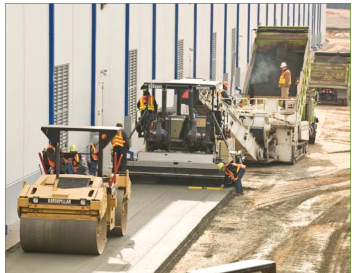
RCC paving train