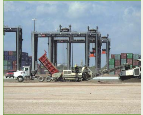
Port terminal, Houston, TX