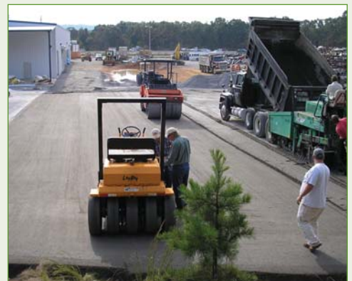
Commercial parking lot