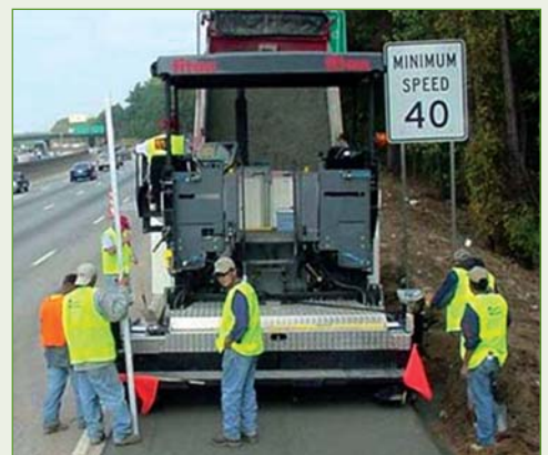
Interstate highway shoulder, Atlanta, GA