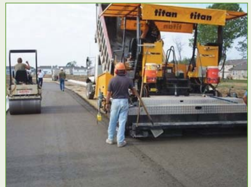
Residential street, Columbus, OH