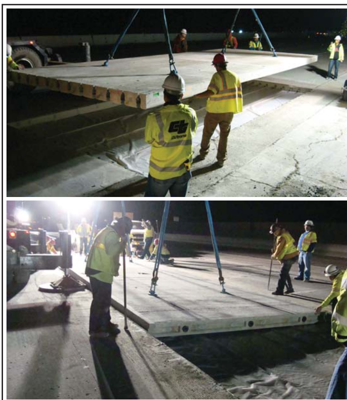
Figure 5. The Interstate 680 project utilized both JPP (top) and PPCP panels (bottom).