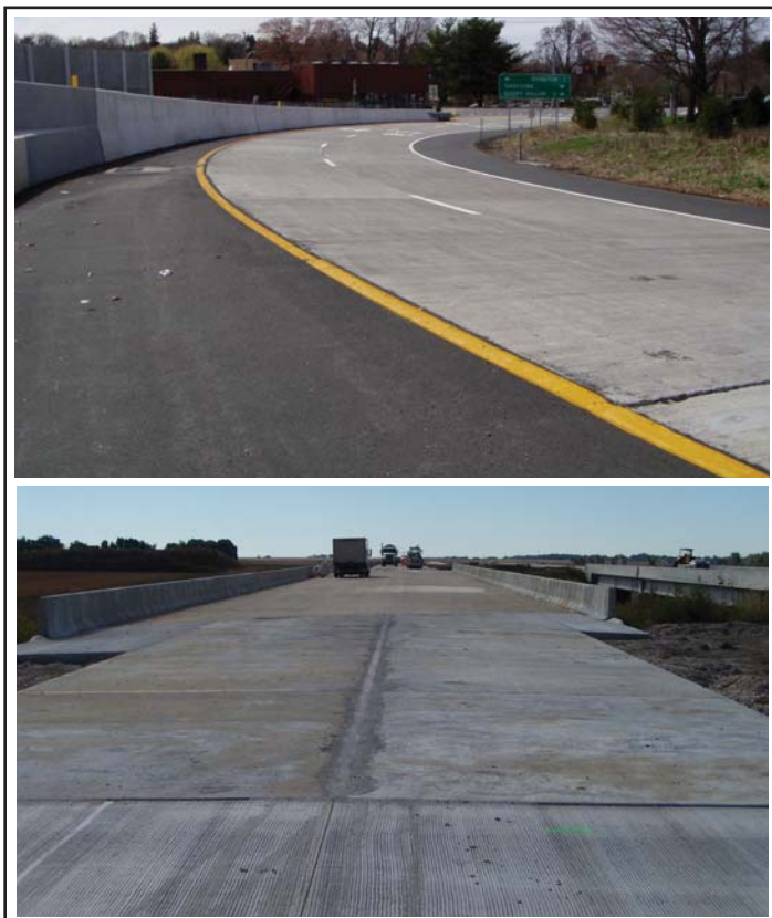
Figure 6. Precast concrete pavement applications include ramps (top) and bridge approach slabs (bottom).

Other applications for PCPS include bridge approach slabs, intersections, ramps, and unbonded overlays (figure 6).