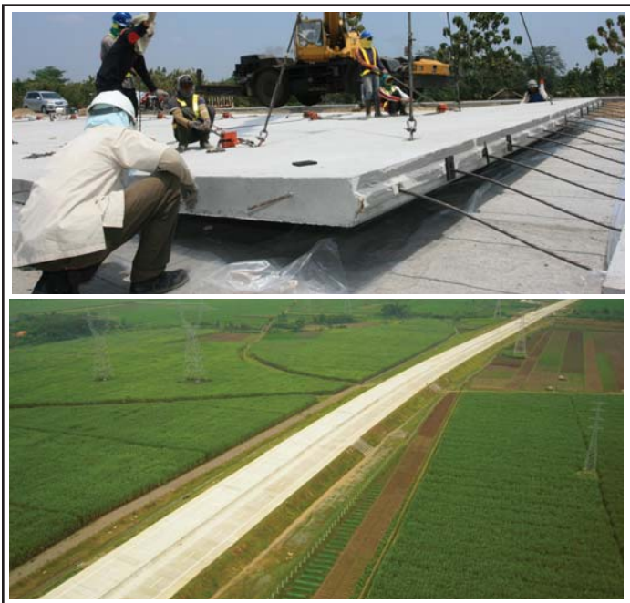
Figure 7. The precast pavement project in Indonesia utilized precast prestressed concrete pavement for 22 miles of new pavement.

helped to employ hundreds of local workers and provided a boost to the local economy. The need for a long-lasting, low-maintenance pavement was also satisfied. (4)