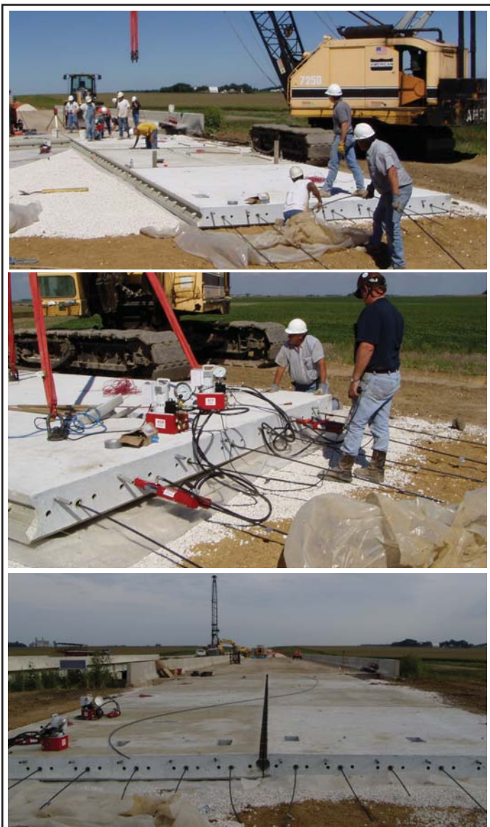
Figure 3. Post-tensioning strands are fed into ducts and through a series of precast panels (top) and are tensioned (center) to put the pavement in compression (bottom).