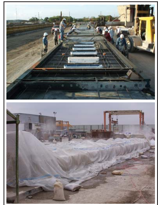
Figure 1. Precast concrete pavement panels are produced and cured in a controlled environment (steam curing [bottom] is not required but is an option for some precasters).

Load transfer between individual precast panels is provided through compression of the joints between panels from post-tensioning. Post-tensioning strands are inserted into ducts