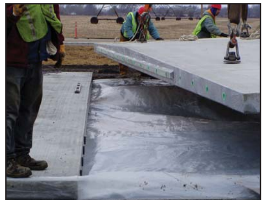
Figure 2. PPCP panels utilize keyways for alignment during installation.